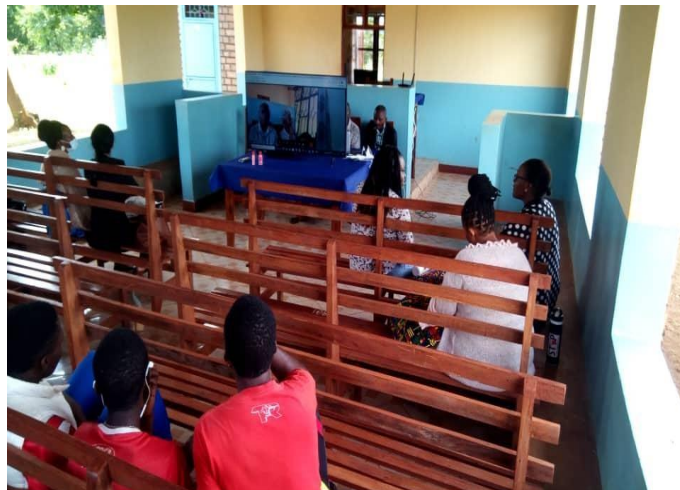
Photo: Mobile court in Nyarugusu camp, the court building was supported by UNHCR. WLAC and Judiciary collaborated in facilitating the building and furniture to enable the virtual court sessions.

The operations of the Mobile court in Nyarugusu facilitating timely justice and cost for refugees, women and children.