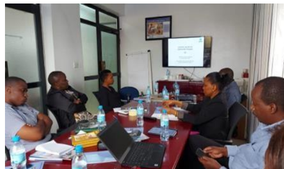
Photo: WLAC staff and UNHCR protection team during session

UNHCR conducted capacity building training to WLAC staff on Refugee Status Determination (RSD) and International Protection. The training was an opportunity for WLAC to discuss number of issues based on the protection interventions that WLAC have been undertaking to protect the persons of concern.